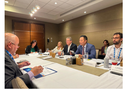
Council and staff met with Ontario Minister of Tourism, Stan Cho.