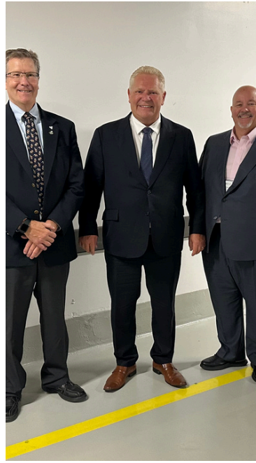
MPP Brian Saunderson, Premier Doug Ford, Mayor Brian Smith

Council and staff met with Ontario Minister of Infrastructure, Kinga Surma to discuss infrastructure priorities and the issue of millions of dollars of vacant, underutilized, provincially owned parcels of land in the Town of Wasaga Beach. The Minister acknowledged that the government is working on a solution to better understand what lands the province owns and where possible, free up provincially owned land for higher and better uses in municipalities, including the Town of Wasaga Beach.