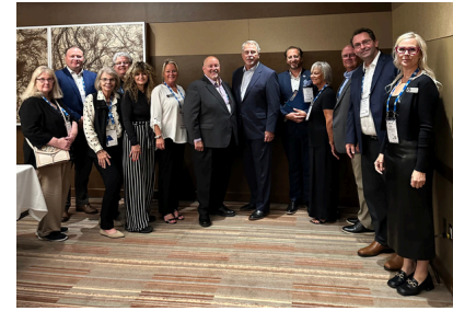
Council and staff met with Ontario Minister of Sport, Neil Lumsden.

Council and staff met with Ontario Minister of Infrastructure, Kinga Surma to discuss infrastructure priorities and the issue of millions of dollars of vacant, underutilized, provincially owned parcels of land in the Town of Wasaga Beach. The Minister acknowledged that the government is working on a solution to better understand what lands the province owns and where possible, free up provincially owned land for higher and better uses in municipalities, including the Town of Wasaga Beach.